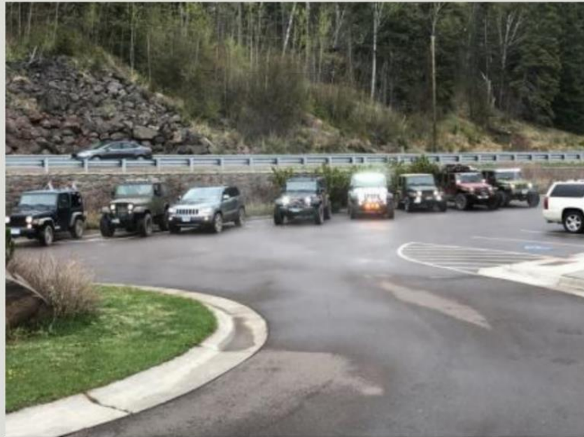
This group of vehicles followed the proposed B2B route through Cook County.